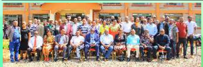
TVETA Officials, KATTI Members, Industry Experts, and Trainers from Mt. Kenya Region during a workshop on the development of the Competency-Based Skilling (CBS) curriculum.