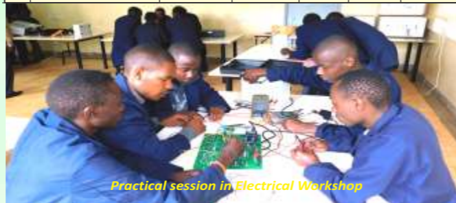
Practical session in Electrical Workshop