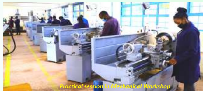
Practical session in Mechanical Workshop