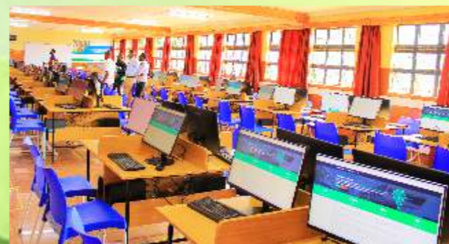
Modern Computer Science Lab