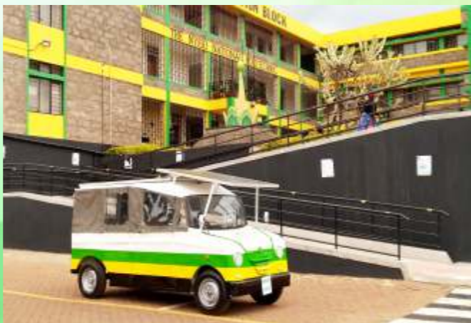
Solar driven electrical vehicle innovation

The Nyeri National Polytechnic (NNP) wishes to announce the May 2023 intake courses. The Polytechnic is established under the Legal Notice No. 91 of 2016 which gives it the mandate to independently design, develop and examine curricula, and grant academic awards. These courses are accredited by Kenya National Qualification Authority (KNQA) at Levels 5 & 6 which is equivalent to Certificate and Diploma respectively. The NNP CBET courses are Competency Based which aims at equipping trainees with skills required in the industry.