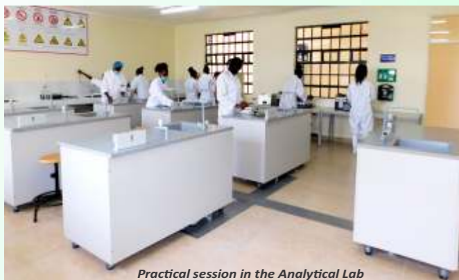
Practical session in the Analytical Lab