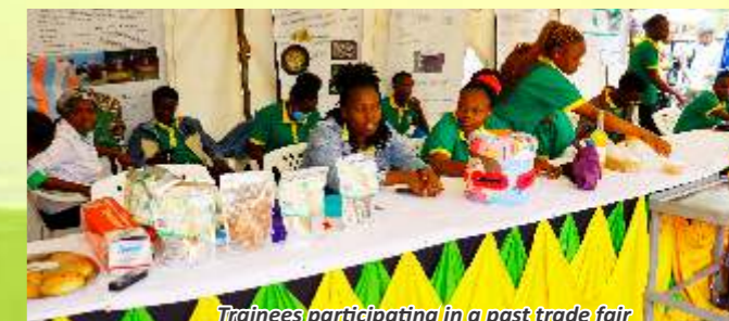
Trainees participating in a past trade fair