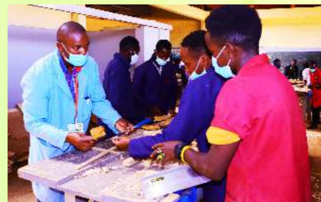
Practical session in Building - Carpentry Workshop